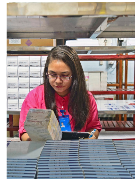
ARHC Quality Assurance team checking the samples of procured products supported by the Global Fund.

The regional Tuberculosis Elimination among Migrants (TEAM) programme through UNOPS as a regional Principal Recipient aimed to reduce the TB burden among migrant populations in Cambodia, Lao PDR, Myanmar, Thailand, and Viet Nam. The total grant funded by the Global Fund was US$ 10 million for the period 2019-2021. The regional TEAM programme was focused on three main activities; case finding and treatment support to ensure migrants adhere to treatment; improving data collection and analytic work for advocacy and policy development at the regional level; and bilateral partnership building.