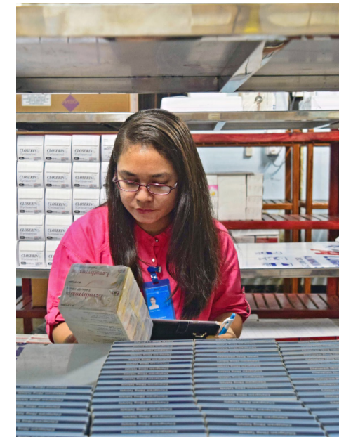
ARHC Quality Assurance team checking the samples of procured products supported by the Global Fund.

The regional Tuberculosis Elimination among Migrants (TEAM) programme through UNOPS as a regional Principal Recipient aimed to reduce the TB burden among migrant populations in Cambodia, Lao PDR, Myanmar, Thailand, and Viet Nam. The total grant funded by the Global Fund was US$ 10 million for the period 2019-2021. The regional TEAM programme was focused on three main activities; case finding and treatment support to ensure migrants adhere to treatment; improving data collection and analytic work for advocacy and policy development at the regional level; and bilateral partnership building.