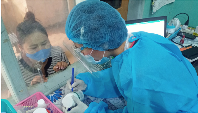
A health provider from one of PR-UNOPS partners, Medical Action Myanmar (MAM) providing medicine to a patient.