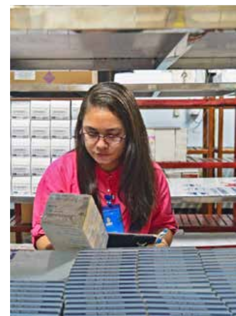
ARHC Quality Assurance team checking the samples of procured products supported by the Global Fund.

The regional Tuberculosis Elimination among Migrants (TEAM) programme through UNOPS as a regional Principal Recipient aimed to reduce the TB burden among migrant populations in Cambodia, Lao PDR, Myanmar, Thailand, and Viet Nam. The total grant funded by the Global Fund was US$ 10 million for the period 2019–2021. The regional TEAM programme was focused on three main activities; case finding and treatment support to ensure migrants adhere to treatment; improving data collection and analytic work for advocacy and policy development at the regional level; and bilateral partnership building.